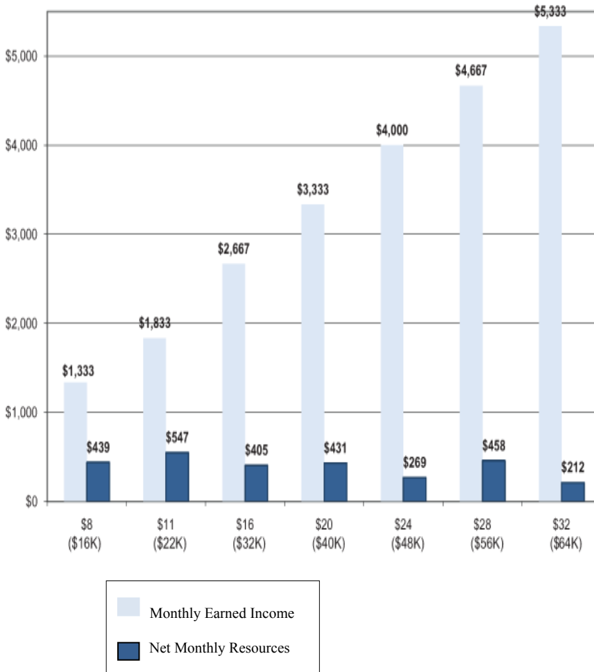
Figure 2. Monthly Earned Income versus Net Monthly Resources 21

Note: From R. Loya, R. Liberman, R. Albelda, and E. Babcock, 2008. “Fits & Starts: The Difficult Path for Working Single Parents”. Available at: www.liveworkthrive.org